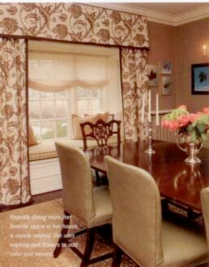
Reynal's dining room, her favorite space in her house, is mostly neutral. She uses napkins and flowers to add color and interest.