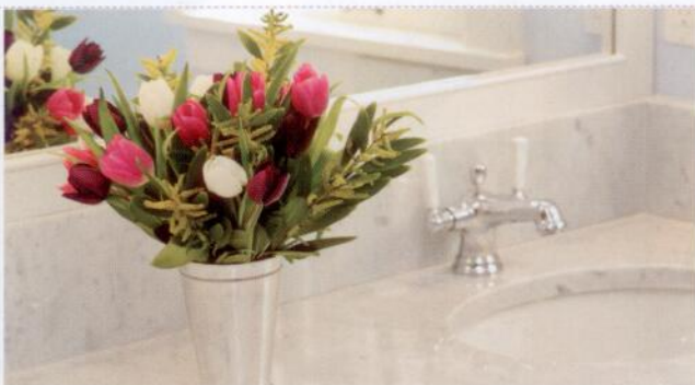
In the bath, both countertop and tile floor stay true to the home's early 20th-century origins.