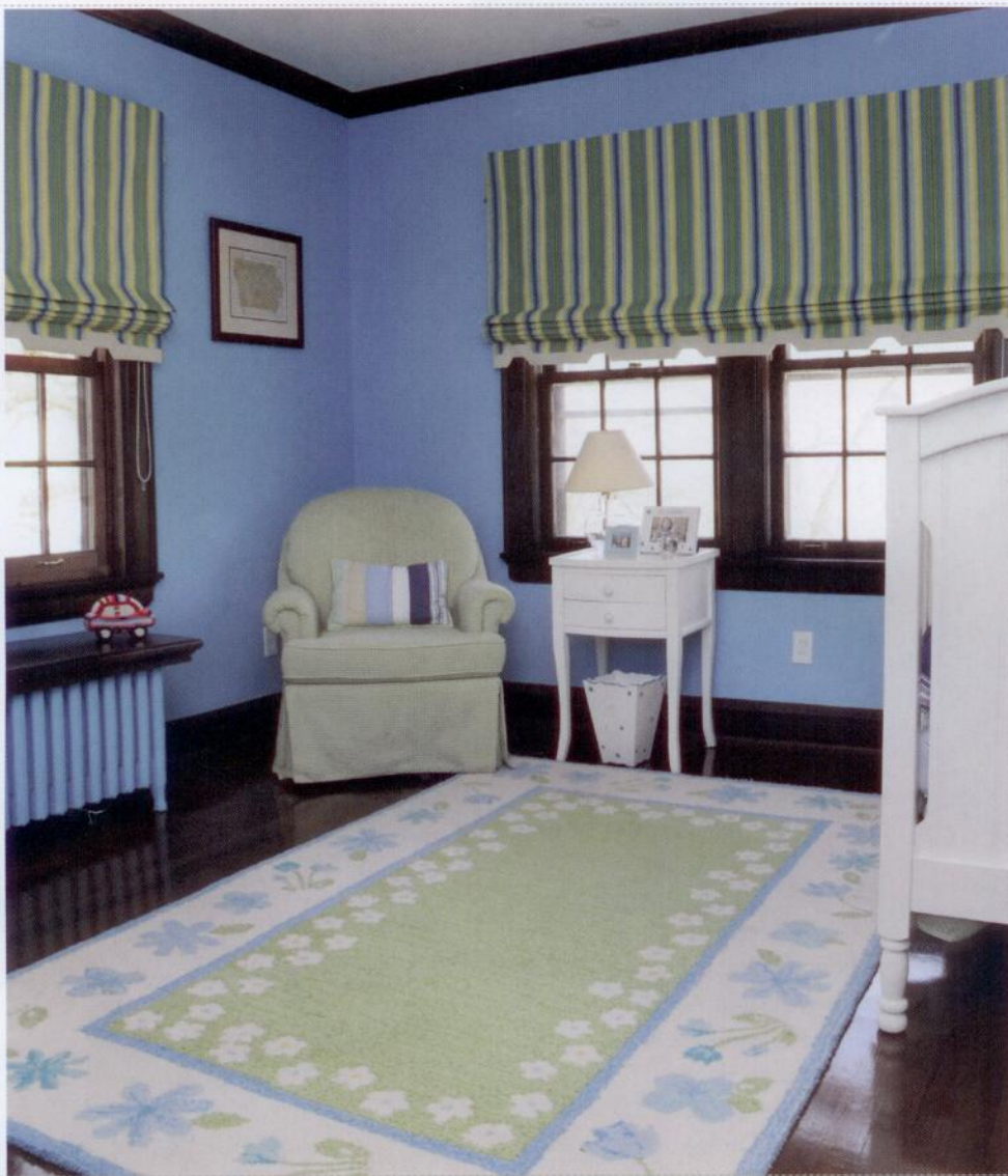
Bright blue and green – on the walls, window treatments, and rugs – remain ageless fabric and color selections. The crib is easily swapped for a bed once the Fletchers' son gets a little older.