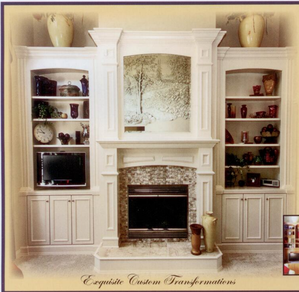
Exquisite Custom Transformations

Fletcher worked with contractor Nelson Hawbaker to widen the tiny bath, enabling her to slide in a tub and double sink. Reynal added signature touches, including light fixtures and a valance. ♣